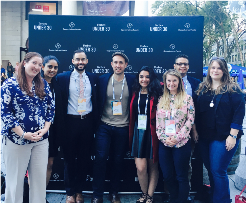
VGL attends Forbes 30 Under 30 Summit with Editor of Forbes Magazine, Randall Lane