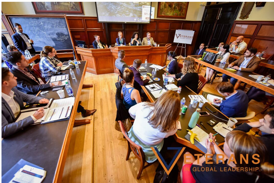
2017 Veterans in Global Leadership Fellows. at 4-Day Flagship Summit at Georgetown University