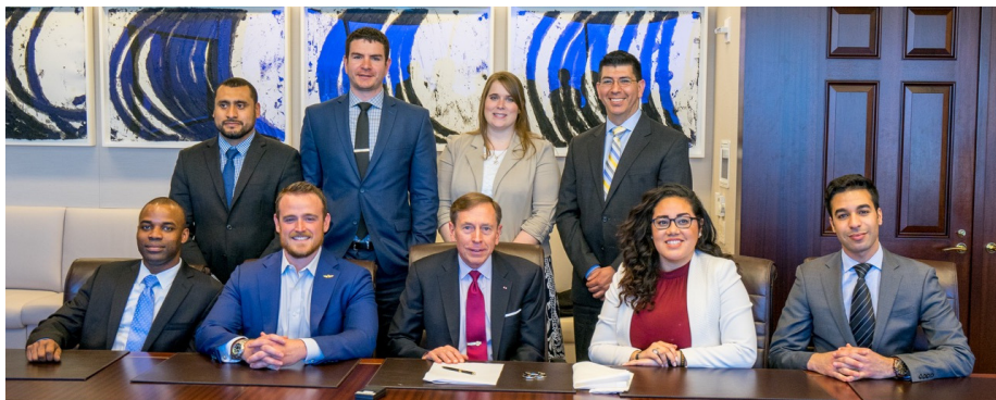
General David Petraeus (Former Director of the Central Intelligence Agency and VGL Advocate) invited VGL Fellows for a private lunch and round-table discussion on leadership.