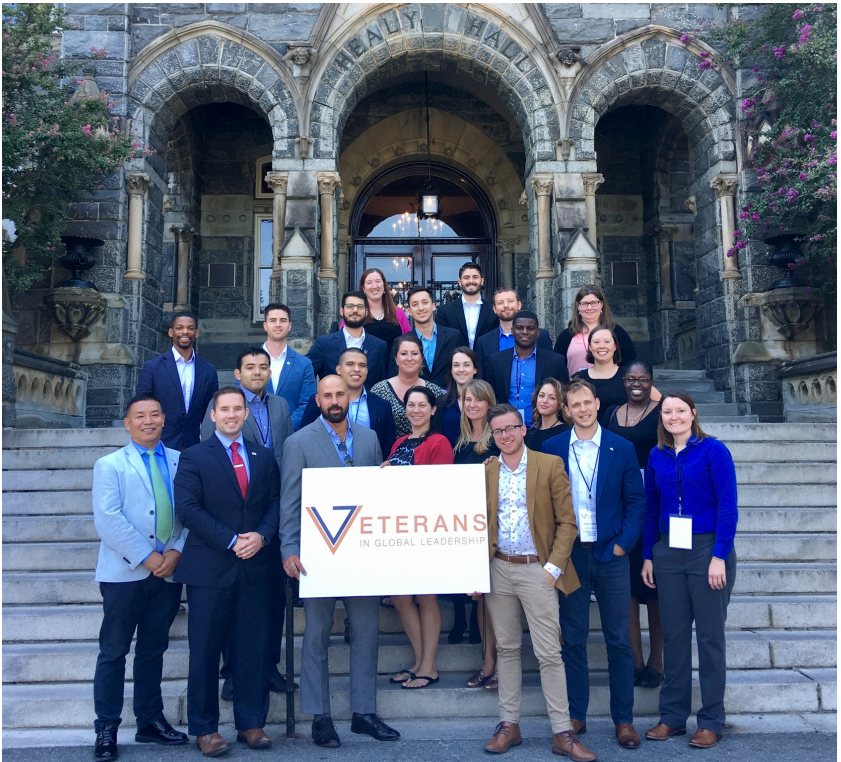
2017 Veterans in Global Leadership Fellows