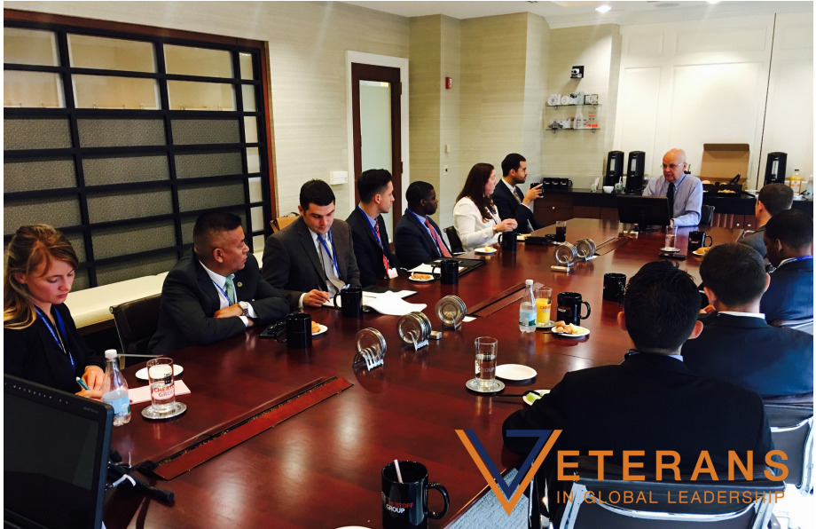
General Michael Hayden (Former Director of the Central Intelligence Agency, Director of National Security Agency and VGL Advocate) invited VGL Fellows for a private breakfast and round-table discussion on leadership.