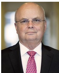
General Michael Hayden