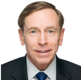
General David Petraeus

General David Petraeus, Former CIA Director Ambassador William Taylor, Former Ambassador to the Ukraine General Michael Hayden, Former CIA and NSA Director