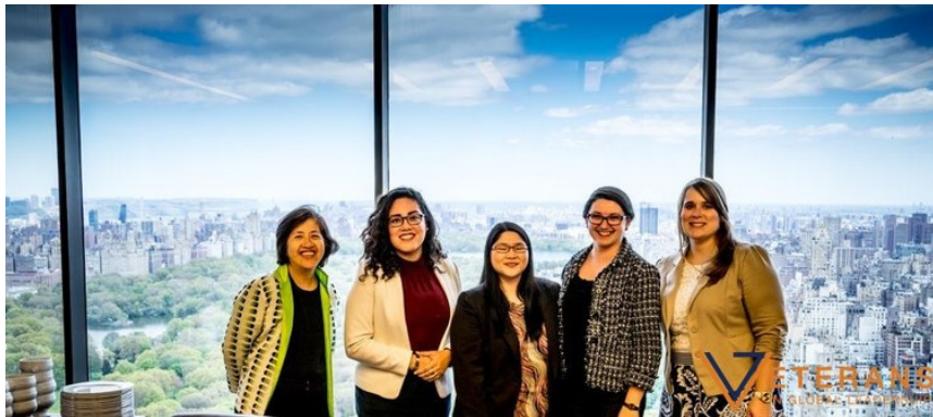
Veterans in Global Leadership Women's Initiative at the 4-day Leadership Seminar